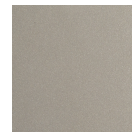
Beige Silver (BS)