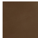
Burnished Bronze (BB)