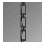
Rectangular Chain (CH3)