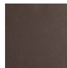
Flat Bronze (FB)