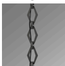
Diamond Chain (CH1)