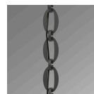
Oval Chain (CH2)