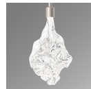
Blossom Clear (BC)