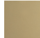
Gilded Brass (GB)