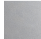
Classic Silver (CS)