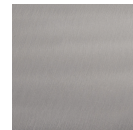
Satin Nickel (SN)