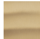
Heritage Brass (HB)