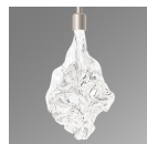
Blossom Clear (BC)